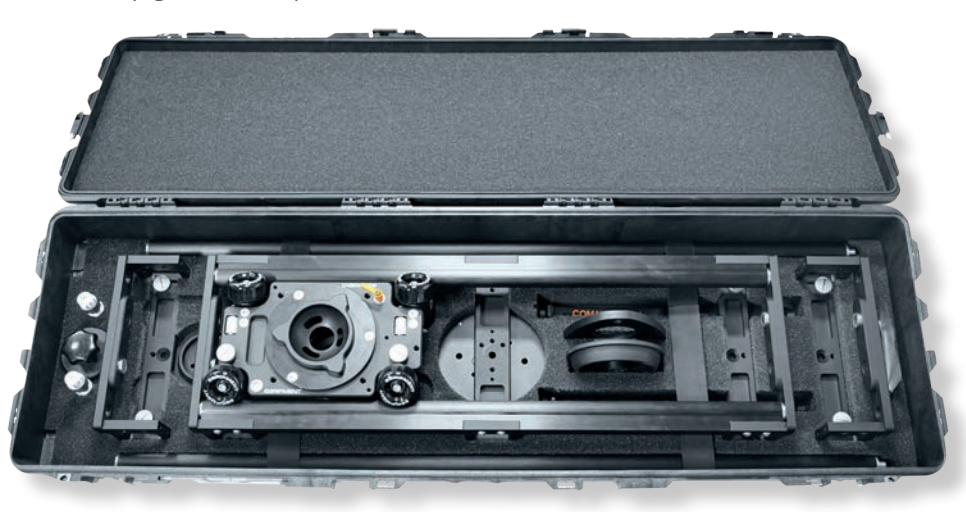
Full setup in transport case (shows additional accessories)

The Egripment wheels are adjustable and specially manufactured for precision and endurance, providing a solid base for optimum shock-free, smooth movements.